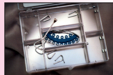
A torquing wrench kit, used to make appliance adjustments, is available from Johns Dental.