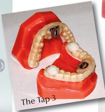
The TAP 3 from Johns Dental consists of a single lingual bar and smaller hook.