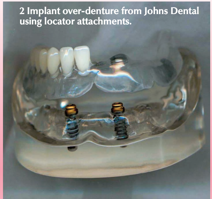
2 Implant over-denture from Johns Dental using locator attachments.