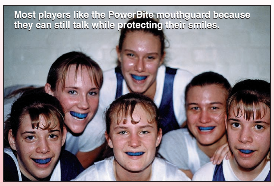
The women's freshman basketball squad at St. Mary of the Woods in Indiana took a break from practice to show off their custom PowerBite Mouthguards in matching team colors. Partnering up with local high schools and colleges is a great way to gain exposure for a dental practice and can lead to many referrals.

In addition, the superior fit makes speaking and breathing easier. The PowerBite is appealing to athletes that need to speak during an athletic event, like a quarterback, a middle line backer or even a point guard.