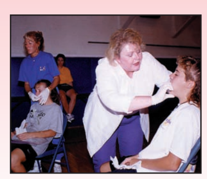
A local dentist and certified dental assistant were able to take impressions for the entire women's basketball team in under an hour.

This scenario has proven effective for professional football players, hockey players and olympic wrestlers.