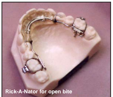
Rick-A-Nator for open bite

This is our standard Rick-A-Nator made with an inclined plane to guide the mandible forward. Johns Dental will need upper and lower models and an advanced bite for an incline.