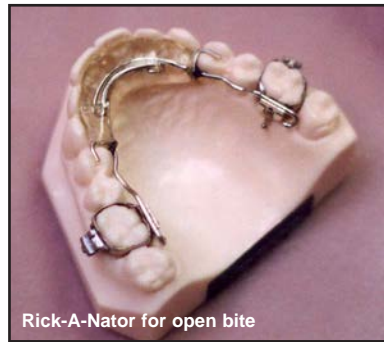
Rick-A-Nator for open bite

This is our standard Rick-A-Nator made with an inclined plane to guide the mandible forward. Johns Dental will need upper and lower models and an advanced bite for an incline.