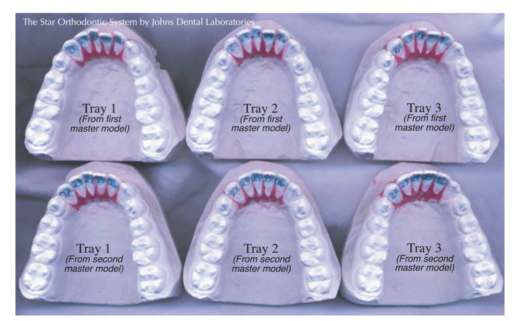
This work in progress case had 6 steps created from two master models. Notice how the arch gradually improves from the first tray (upper left) to the last tray (lower right).

For best results, remove brackets and send upper and lower models along with a prescription indicating which teeth are to be moved.