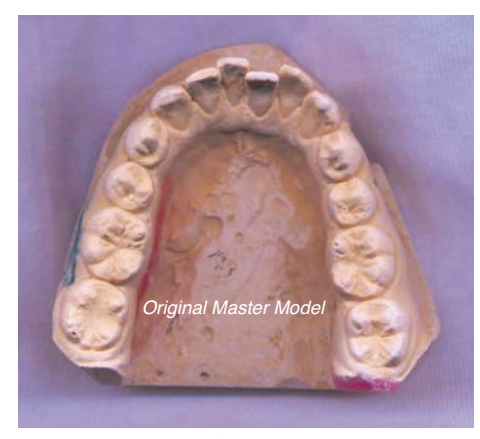
All trays are made from master models like this one shown above. We can make up to 3 trays which covers approximately three months of treatment time.

Using only one model, Johns Dental can make 1, 2 or 3 trays, depending on the amount of tooth movement required. Additional trays can be fabricated from subsequent impressions if needed.