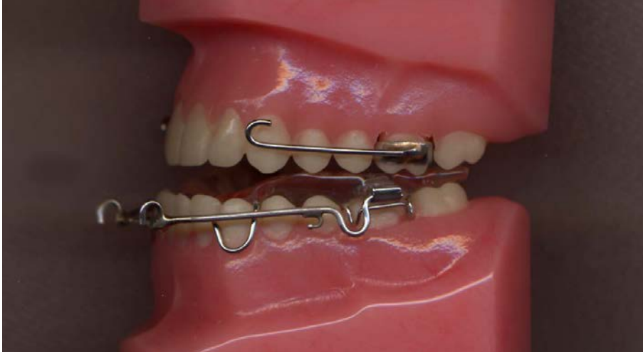
The Removable Tandem Appliance

The Tandem appliance solves many compliance concerns clinicians have with traditional facemask therapy.