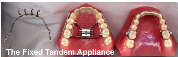
The Fixed Tandem Appliance

Patients are seen one week later to verify compliance and to check the appliance. The patient is then scheduled every six weeks to monitor progress.